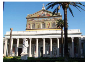
BASILICA OF ST PAUL OUTSIDE THE WALLS, ROME

This morning, we stop at St. Alphonsus Liguori , built and named in honor of the founder of the Redemptorist Congregation, St. Alphonsus Liguori, but was dedicated to the Most Redeemer. The church contains the original Picture of Our Lady of Perpetual Help. Visit there to venerate this Holy icon. Next, we stop at the renowned Colosseum for a brief photo stop (outside only). Then, we proceed through the HOLY DOOR of St Paul Outside the Walls , a beautiful basilica [UNESCO listed] which houses the remains of St. Paul under the main altar. We visit the basilica and then the catcombs before proceeding to the hotel for a farewell dinner with wine. Overnight in Rome. [B,D]