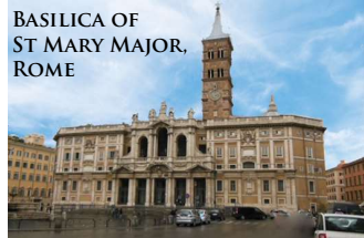
BASILICA OF ST MARY MAJOR, ROME

This morning we take a day trip to Subiaco to visit the Abbey of San Benedetto. The Abbey was built over the cave that St. Benedict inhabited when he lived as hermit before he received the calling to organize monastic communities. The Monastery of San Benedetto is still active today. Then, we visit the second monastery built by Benedict in Subiaco, named after his twin sister Santa Scolastica. Then, we return to Rome. We visit St. Mary Major , where we pass through the HOLY DOOR . Inside the Basilica we view relics of Jesus' manger from Bethlehem. The remainder of the day is free to explore independently. Suggestions include: